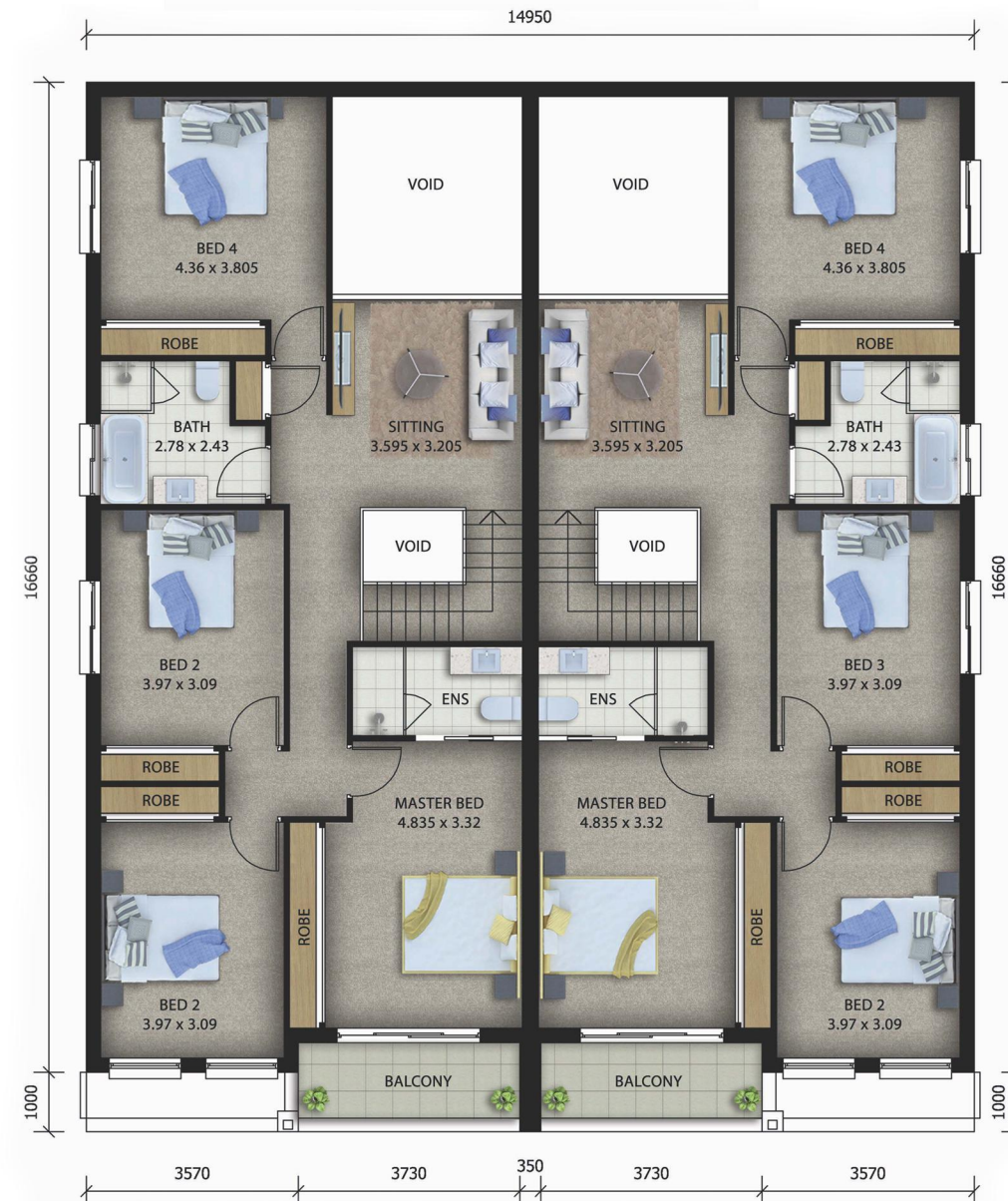
FIRST FLOOR PLAN BAYVIEW DUO