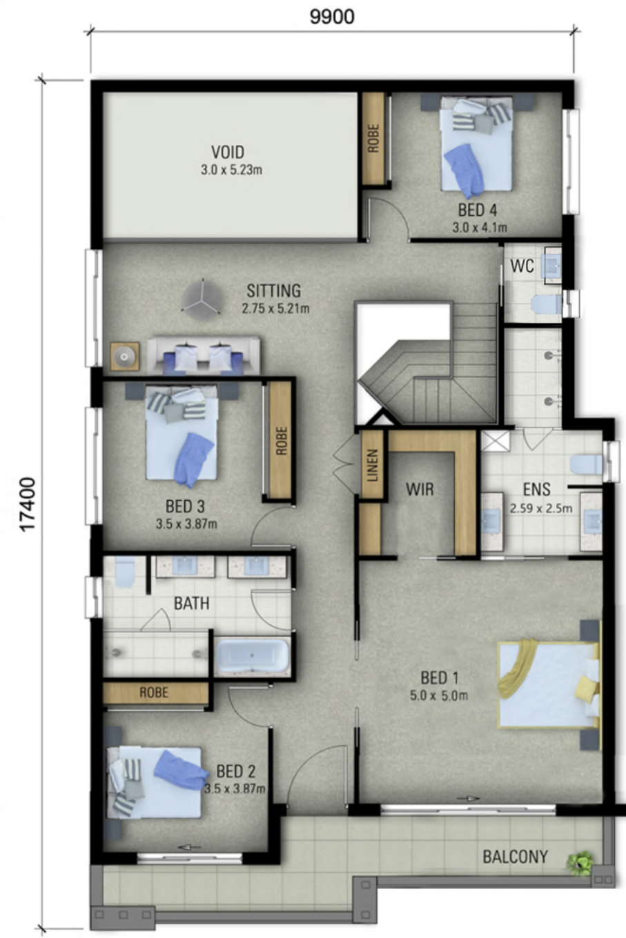
FIRST FLOOR PLAN BRIGHTON OP 1