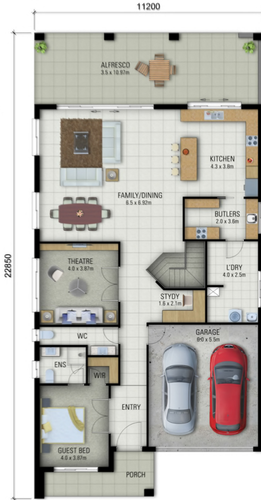
GROUND FLOOR PLAN BRIGHTON OP 1

Our management team is hands on throughout the building process you deal with management direct, not an assistant, they are there to help you. Minimal overheads keep our prices down without compromising on our quality.