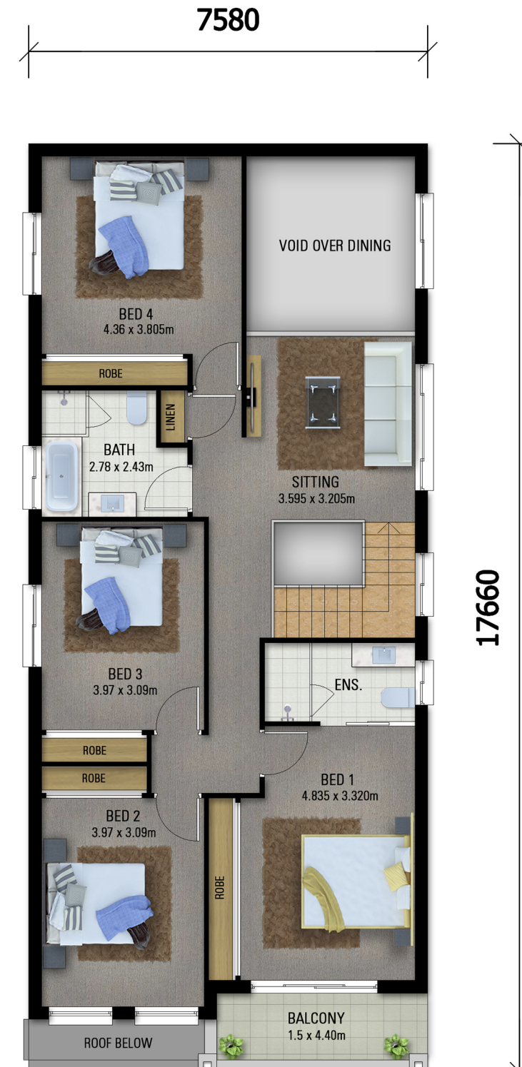
FIRST FLOOR PLAN BAYVIEW