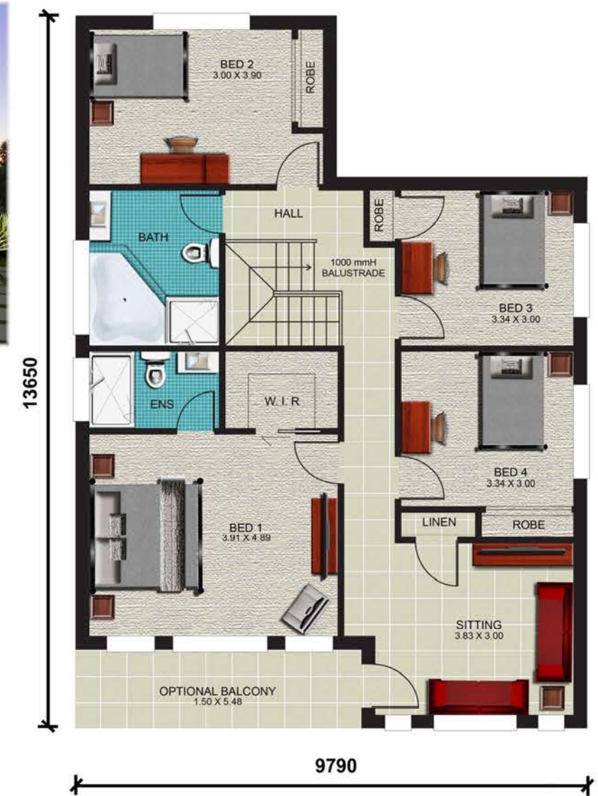
FIRST FLOOR PLAN BERKELEY OPTION 9